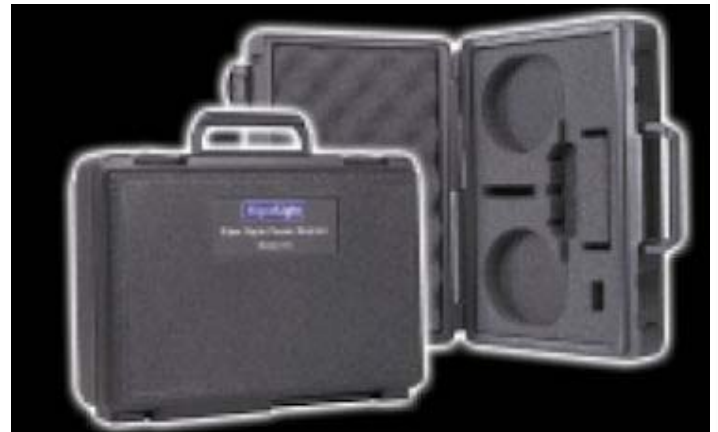
CARRYING CASE High-impact plastic carrying case for field transport and storage of power monitors and accessories. Product Code: C3