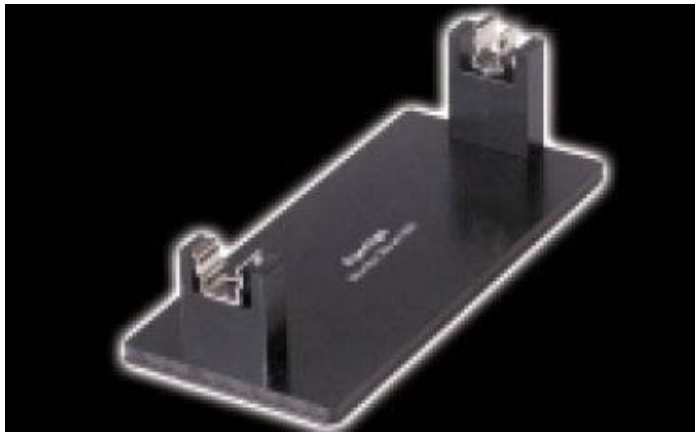
SERIES 300/400 MONITOR MOUNT Anodized aluminum mount with magnetic base for mounting. Product Code: M3/M4