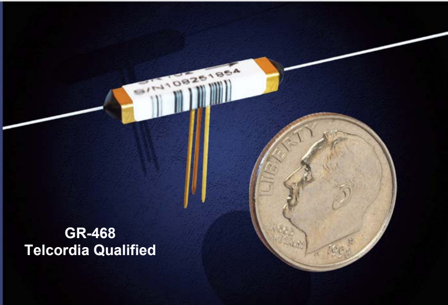
GR-468 Telcordia Qualified

EigenLight's Series 100 PM Fiber Optic Tap Power Monitors are used for in-line measurement of power in polarization maintaining fiber. A miniature, hermetic package houses a stable optical tap and PIN photodiode. EigenLight's patented process maintains PM fiber continuity, avoiding lenses or partial reflectors. This provides exceptional performance and reliability for the most demanding PM power measurement applications.