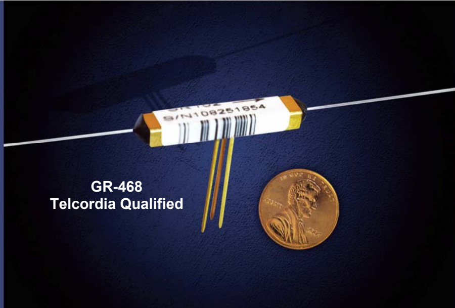
GR-468 Telcordia Qualified

EigenLight's PM Series 100 Inline Power Monitors are used for monitoring optical power in polarization maintaining fiber. By combining a stable optical tap and PIN photodiode in a miniature, hermetic package, these PM devices offer cost and performance advantages over discrete PM coupler and photodiode combinations.